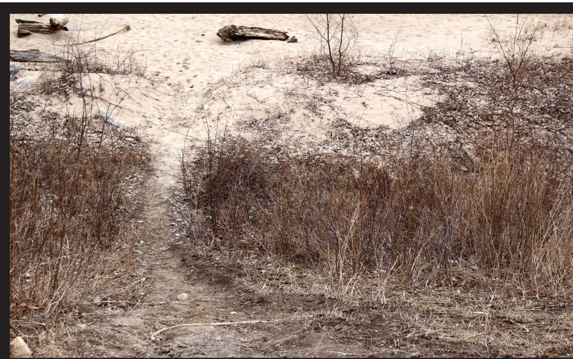
Unauthorized trails leading down the bluff of Lake Michigan where sensitive species are located