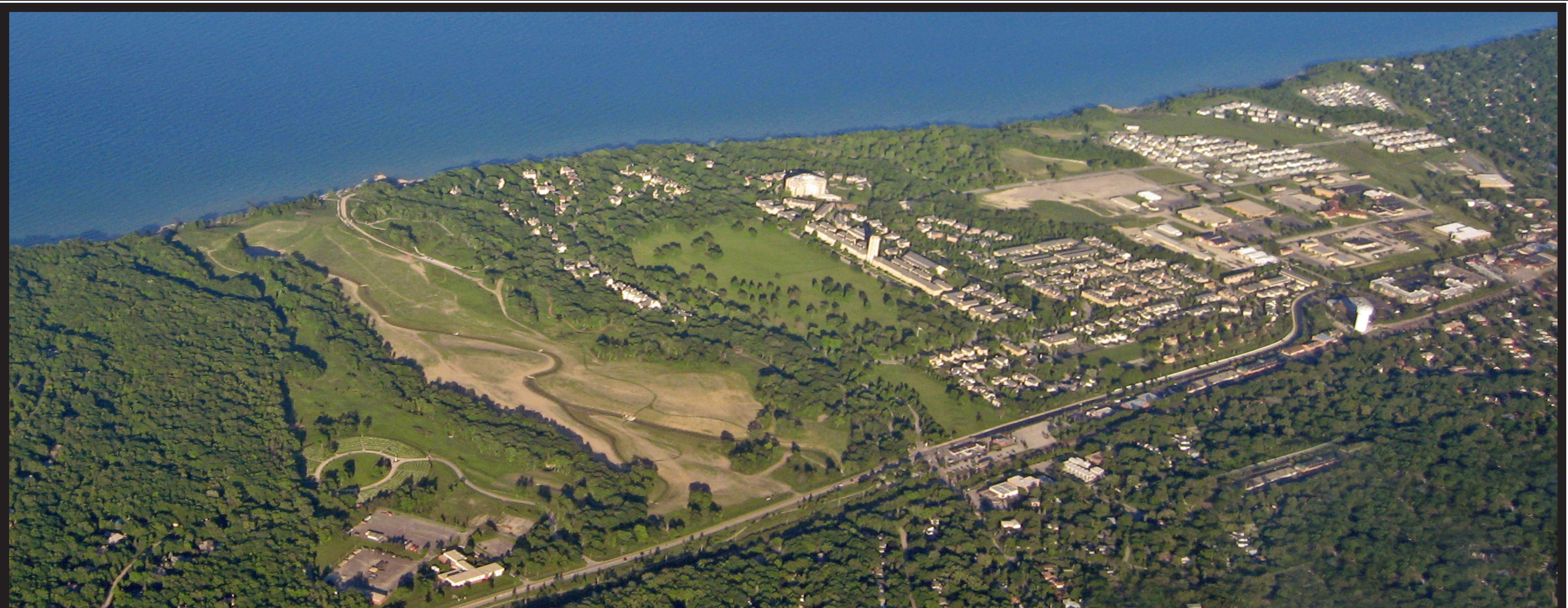
Fragmentation of forested Lake Michigan flyway