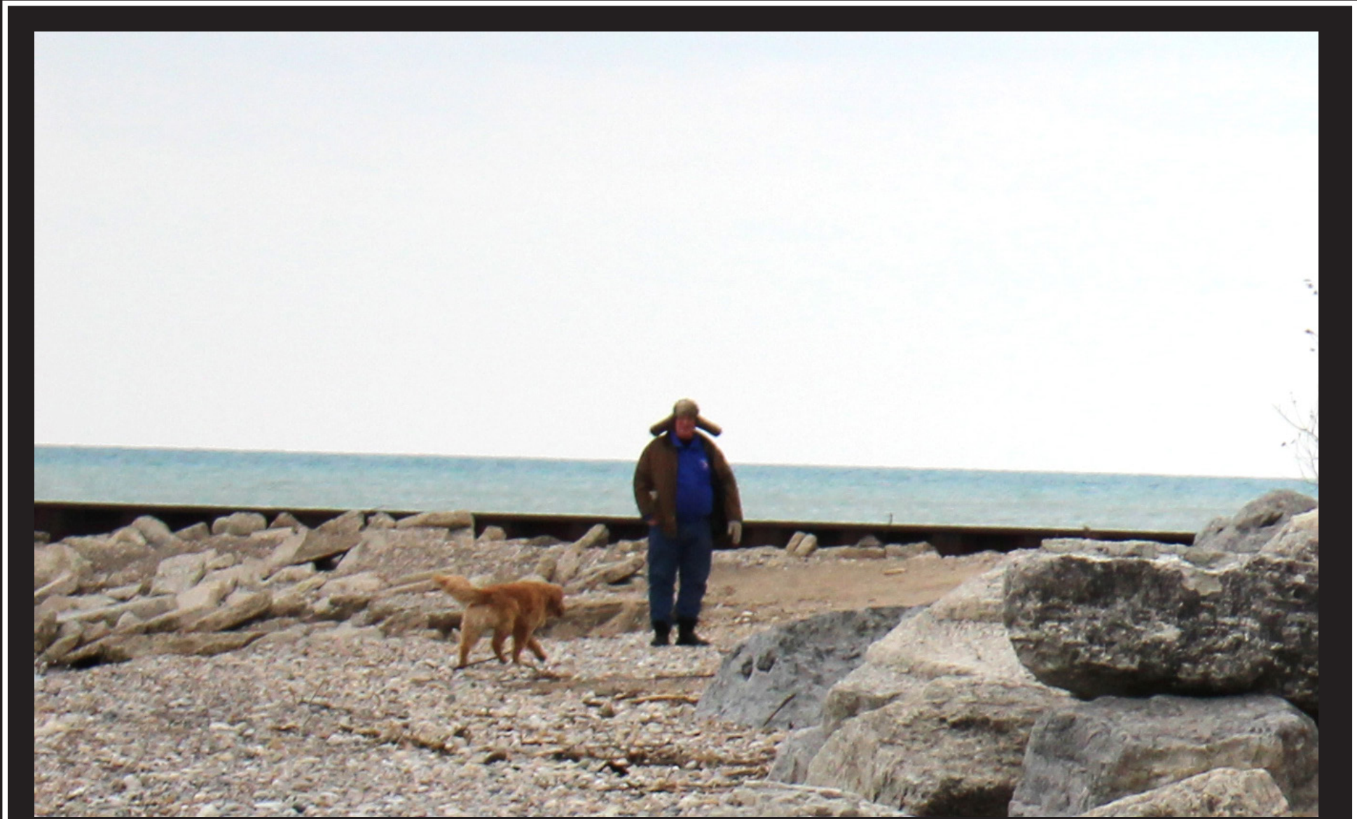
Dogs off-leash put the endangered, threatened and rare species at risk.