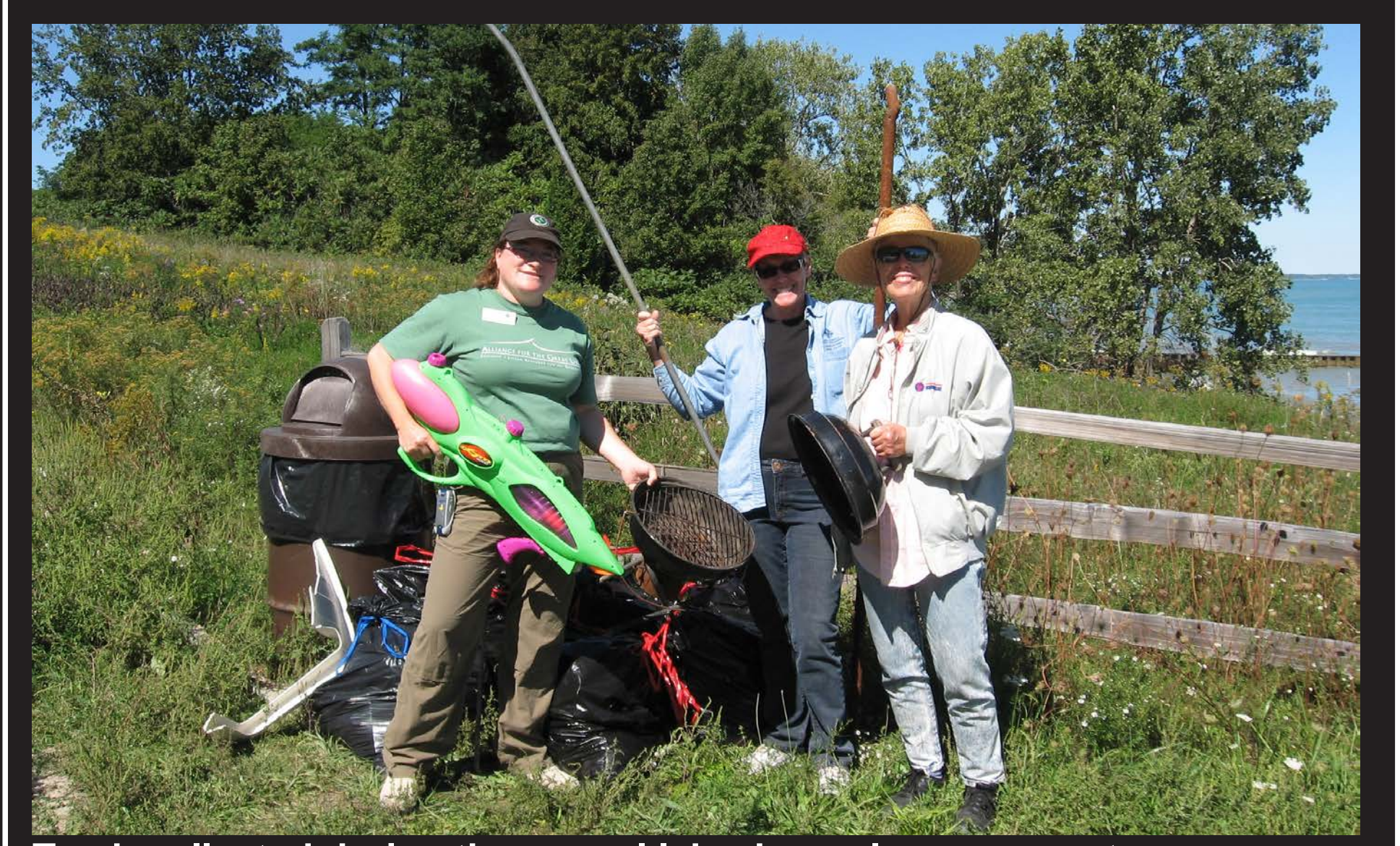
Trash collected during the annual lakeshore clean-up event