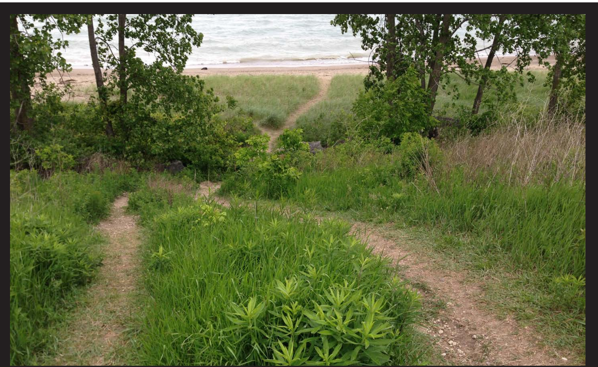
Unauthorized trails leading down the bluff of Lake Michigan where sensitive species are located