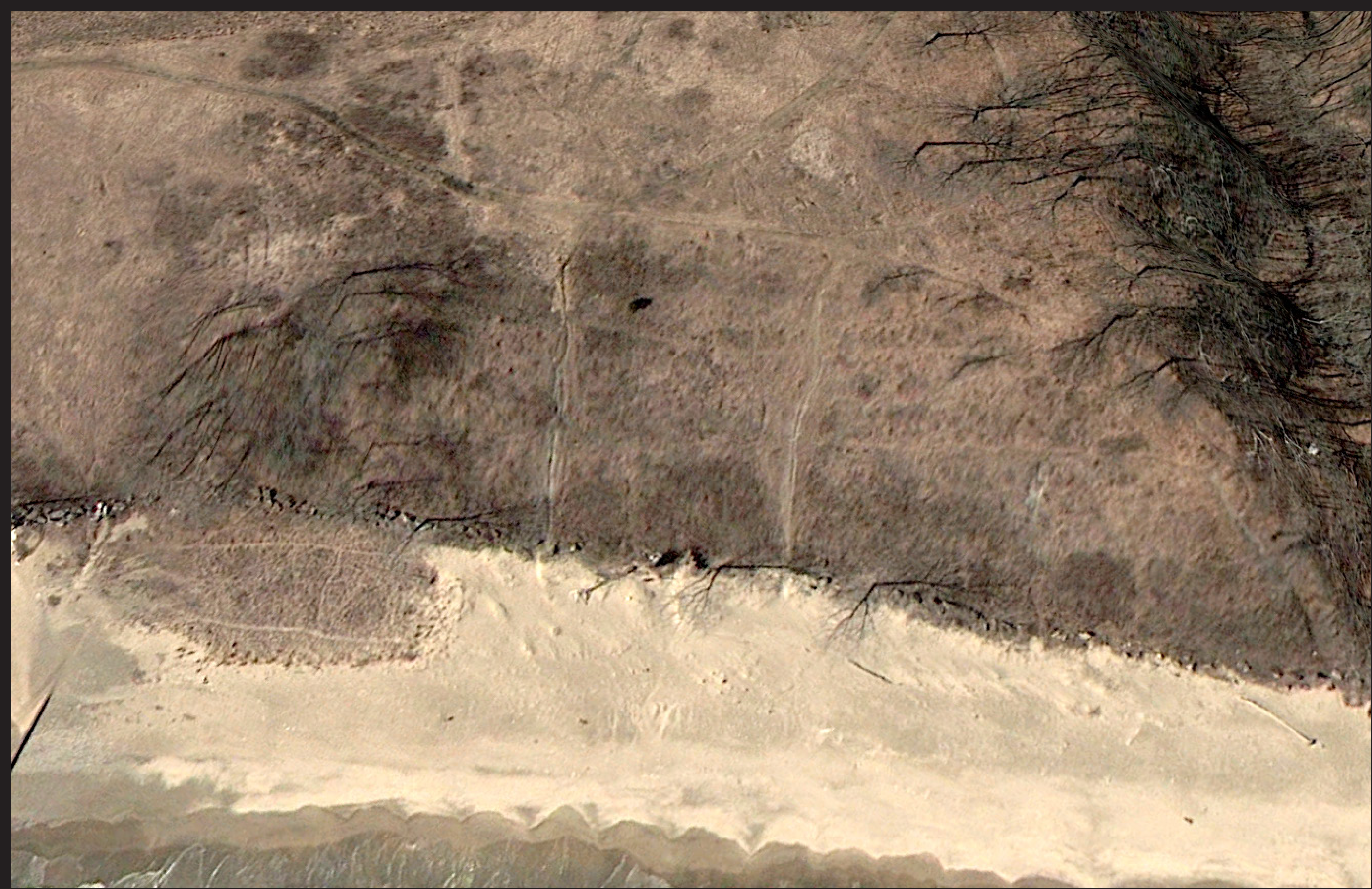
Aerial views of multiple unauthorized trails leading down the bluff of Lake Michigan where sensitive species are located. These steep slopes are extremely vulnerable to erosion leading to slope failure.