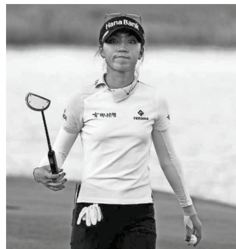
Lydia Ko took the first-round CME Group Tour Championship lead with a 65 Thursday.

Brooke Henderson withdrew from last week's Pelican event with an injury to her upper back and said that she wasn't even sure if she could tee it up this week. The Canadian lives part time here in Naples and felt well enough on Thursday to shoot 68. Henderson, a two-time winner this year, said she made some adjustments to her swing to be able to play.