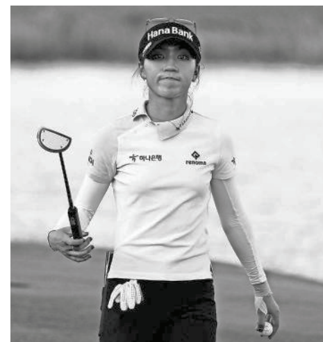
Lydia Ko took the first-round CME Group Tour Championship lead with a 65 Thursday.

Brooke Henderson withdrew from last week's Pelican event with an injury to her upper back and said that she wasn't even sure if she could tee it up this week. The Canadian lives part time here in Naples and felt well enough on Thursday to shoot 68. Henderson, a two-time winner this year, said she made some adjustments to her swing to be able to play.