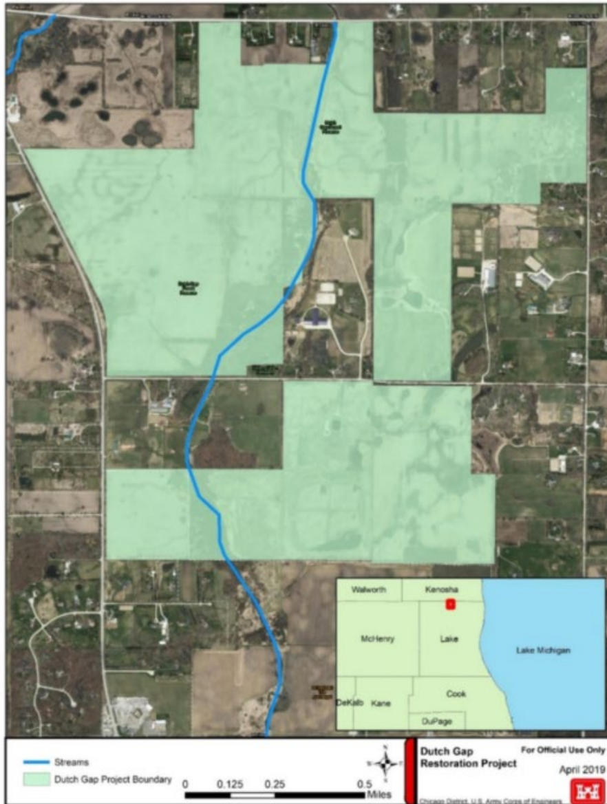
Figure 1: Dutch Gap Study Area