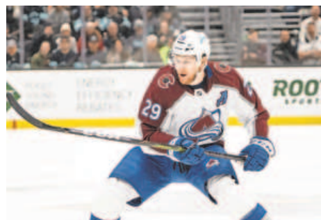
Avalanche forward Nathan MacKinnon's playoff hat trick was capped by a spectacular end-to-end rush.

Their deep corps of forwards is led by superstar center Nathan MacKinnon, who has been on a mission since the Avs were eliminated in the second round last year. Their captain, Gabriel Landeskog, is a boss. Their talented defense is