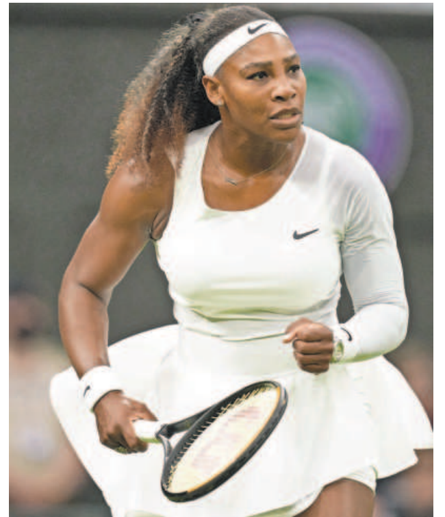
Serena Williams has won the singles title seven times at Wimbledon.

Williams' 23 Grand Slam titles are one shy of Margaret Court's record.