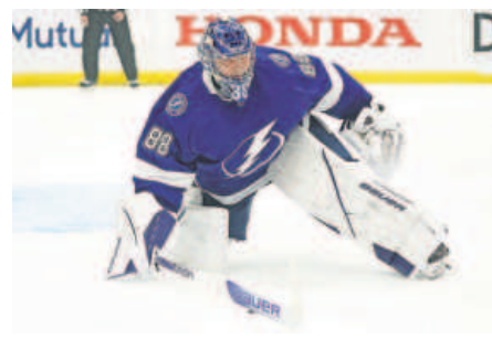
Lightning goaltender Andrei Vasilevski is 12-5 with a 2.27 goals against average and.928 save percentage.

This series is tough to call. If you think speed will prevail, go with the Avs. They're in another warp class than the Toronto Maple Leafs and