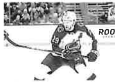
Avalanche forward Nathan MacKinnon's playoff hat trick was capped by a spectacular end-to-end rush.

Their deep corps of forwards is led by superstar center Nathan MacKinnon, who has been on a mission since the Aves were eliminated in the second round last year. Their captain, Gabriel Landeskog, is a boss. Their talented defense is