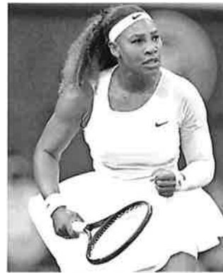
Serena Williams has won the singles title seven times at Wimbledon.

Williams' 23 Grand Slam titles are one shy of Margaret Court's record.