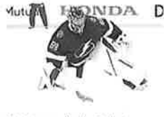
Lightning goaltender Andrei Vasilevski is 12-5 with a 2.27 goals against average and.928 save percentage.

led by Cale Makar, who is drawing comparisons to Robby Orr. And rightly so.