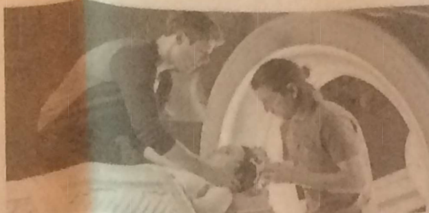
Medical students Jamie (James Norton) and Ray (Diego Luna) prepare as Courtney (Ellen Page) braces for death in the remake of Flatliners, in theaters Friday.

"I'd like to believe in reincarnation. That we're on this Earth to accomplish something, and that if