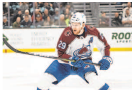
Avalanche forward Nathan MacKinnon's playoff hat trick was capped by a spectacular end-to-end rush.

Their deep corps of forwards is led by superstar center Nathan MacKinnon, who has been on a mission since the Avs were eliminated in the second round last year. Their captain, Gabriel Landeskog, is a boss. Their talented defense is