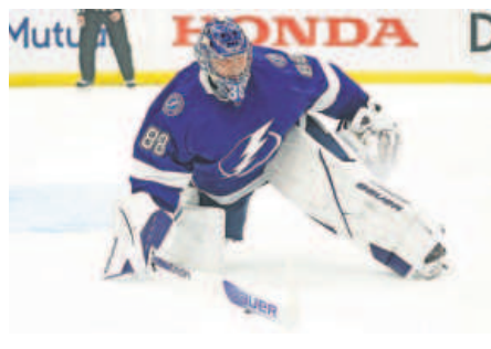
Lightning goaltender Andrei Vasilevski is 12-5 with a 2.27 goals against average and.928 save percentage.

This series is tough to call. If you think speed will prevail, go with the Avs. They're in another warp class than the Toronto Maple Leafs and