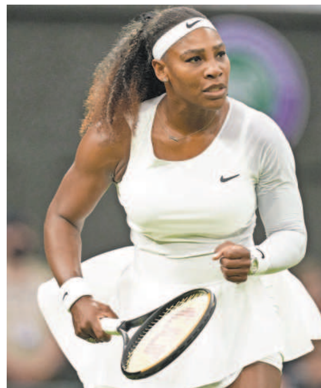
Serena Williams has won the singles title seven times at Wimbledon.

Williams' 23 Grand Slam titles are one shy of Margaret Court's record.