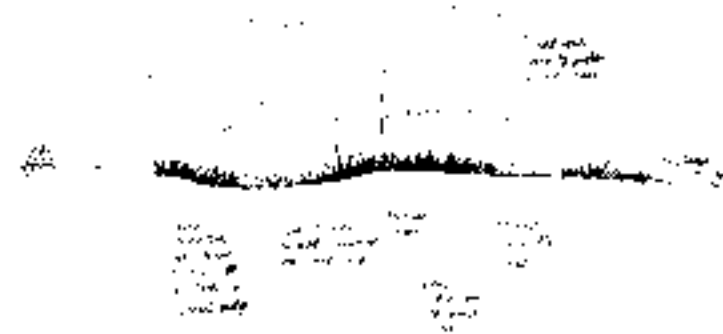
Goal 6 Example Steven Spears, DesignWorkshop

Measure: Decrease highway noise on exterior program of project