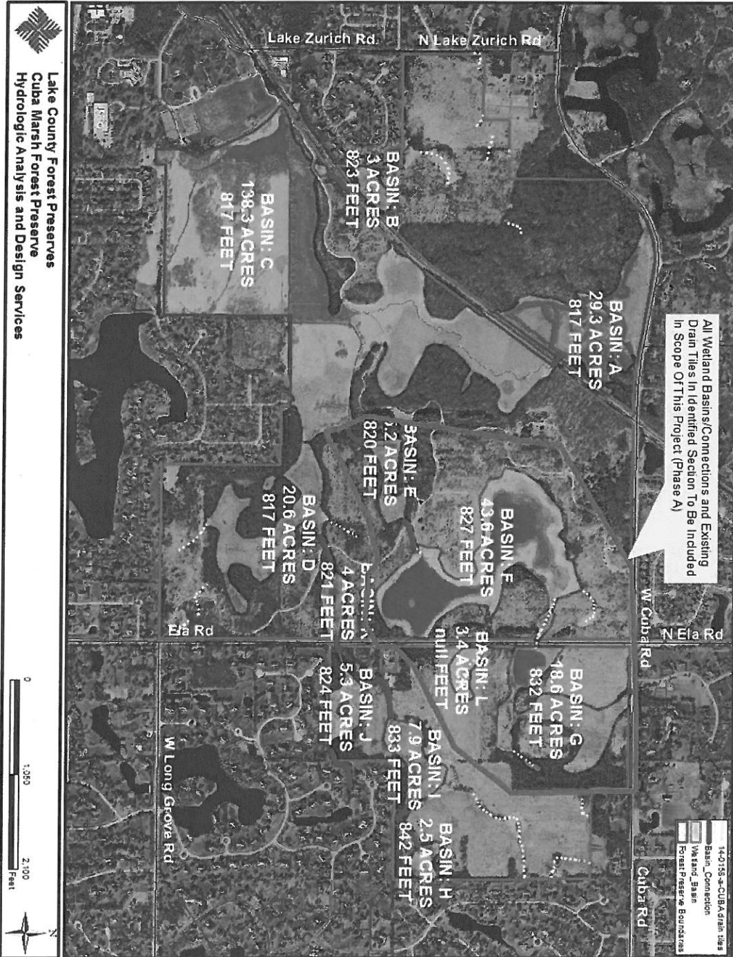
Figure 1: Project A: Hydrologic Analysis and Design Services – Cuba Marsh Forest Preserve