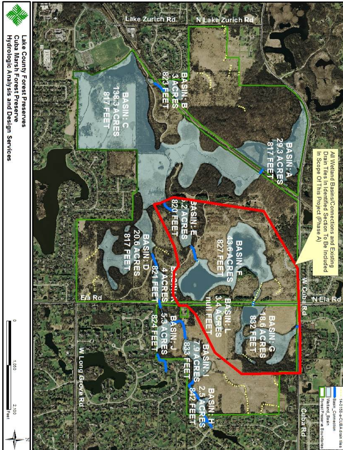
Figure 1: Project A: Hydrologic Analysis and Design Services – Cuba Marsh Forest Preserve