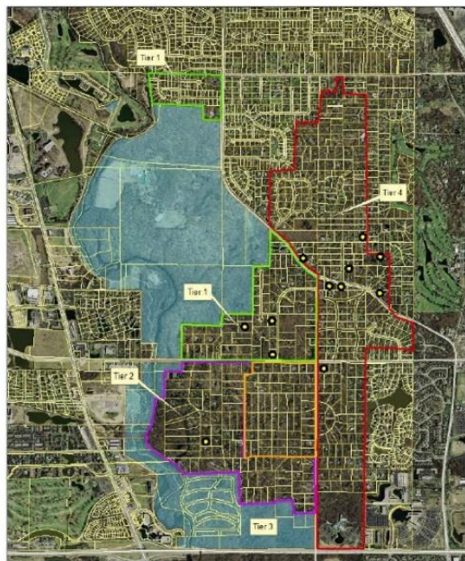
Ryerson Conservation@Home Pilot Project

Contacting 530 households within Riverwoods and Lincolnshire. Working with the Riverwoods Preservation Council. Collaborating with the Village of Riverwoods. Participated in the April 30 th Preservation Council’s Arbor Fest.