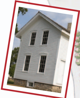
West House, circa 1850.