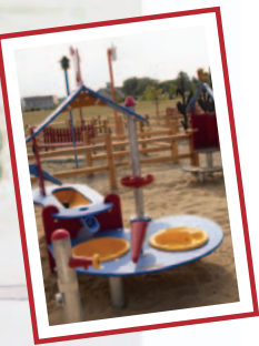
Play with Sand!